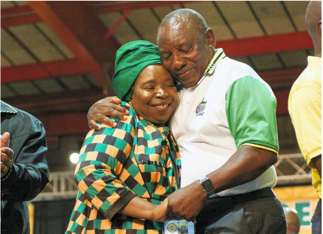
VICTORY HUG: ANC president Cyril Ramaphosa is congratulated by his rival, Nkosazana Dlamini-Zuma

have been a technical problem with the ANN7 deal – but (of course) they are still implausibly denying that it had anything whatsoever to do with trying to buy influence with government via the Guptas.