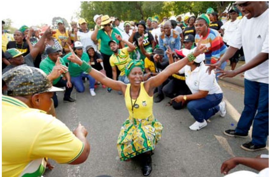
Supporters of Cyril Ramaphosa celebrate outside Nasrec

The answer is no, and the evidence is provided by the current flurry of important and encouraging developments of the past few weeks. And this why it is important for the SACP and all progressive and patriotic forces not to stand aloof from the sudden burst of momentum that is now underway. At the same time, in acknowledging and commending Ramaphosa’s evident leading role in the current drive, we must not indulge in naive euphoria and a belief that the