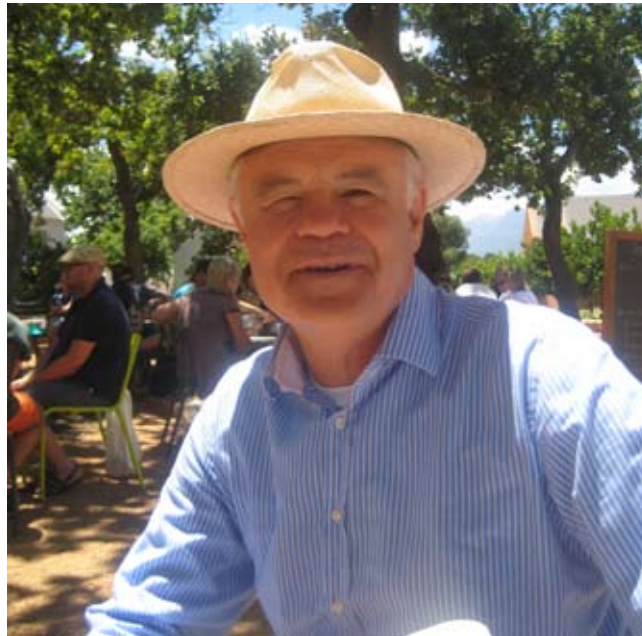
KOOS BEKKER : Naspers chairperson and the brains behind its monopoly growth