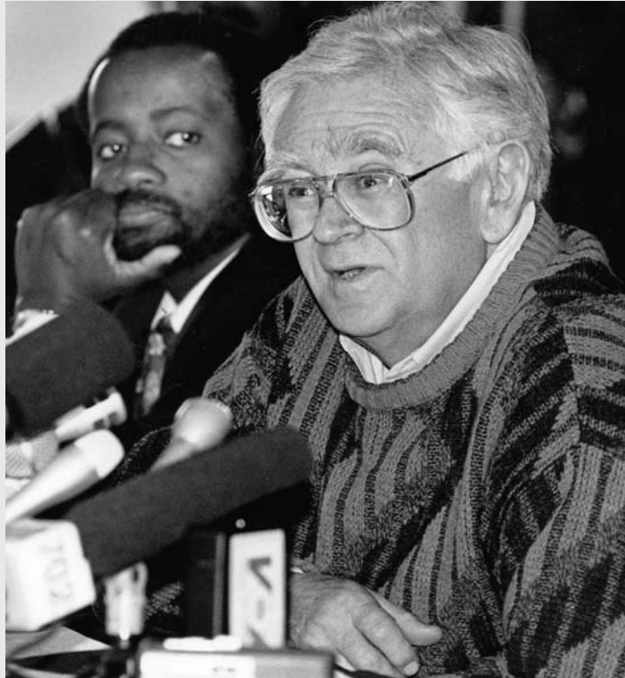
JOE SLOVO: with ANC spokesperson Pallo Jordan in 1992

Cde Joe Slovo was born in Lithuania in 1926 and came to South Africa with his family as a nine-year-old. He was active in the CPSA from 1940. He was banned by the apartheid government in 1954. In 1955 he actively contributed to the Freedom Charter, but couldn't attend the Congress of People – he watched it through binoculars. In 1956 he was a Treason Trialist. He was a founder member of MK and narrowly missed arrest at Rivonia while on an external MK mission. He served as Chief of Staff of MK and played a leading role in Special Ops and in Operation Vula.