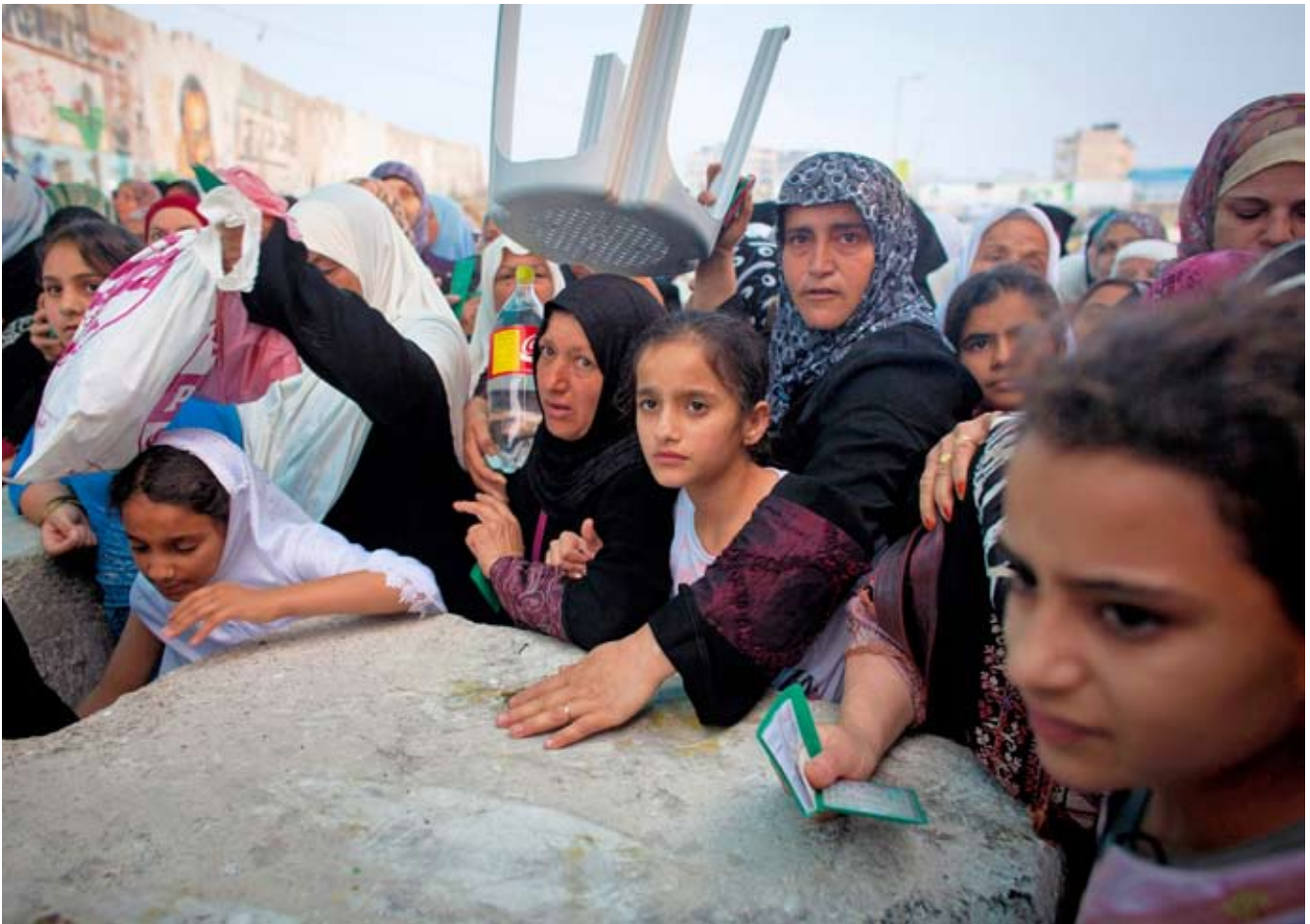
Palestinian women and girls, forced to squeeze between concrete blocks to access checkpoints in Israel's 'Separation Wall' to attend Friday prayers – on the other side. Israeli troops and police forcibly separate males from females crossing the wall to attend their mosque.

cleansing, since the 1948 Nakba (when more than 700 000 Palestinian fled or were expelled from their homes, during the 1948 Israeli war on Palestine). The Palestinian people's resistance to colonisation has in fact been longer than that. From the Balfour Declaration of 1917 to the present, Palestinians have fought for their dignity, their rights, and their lands.