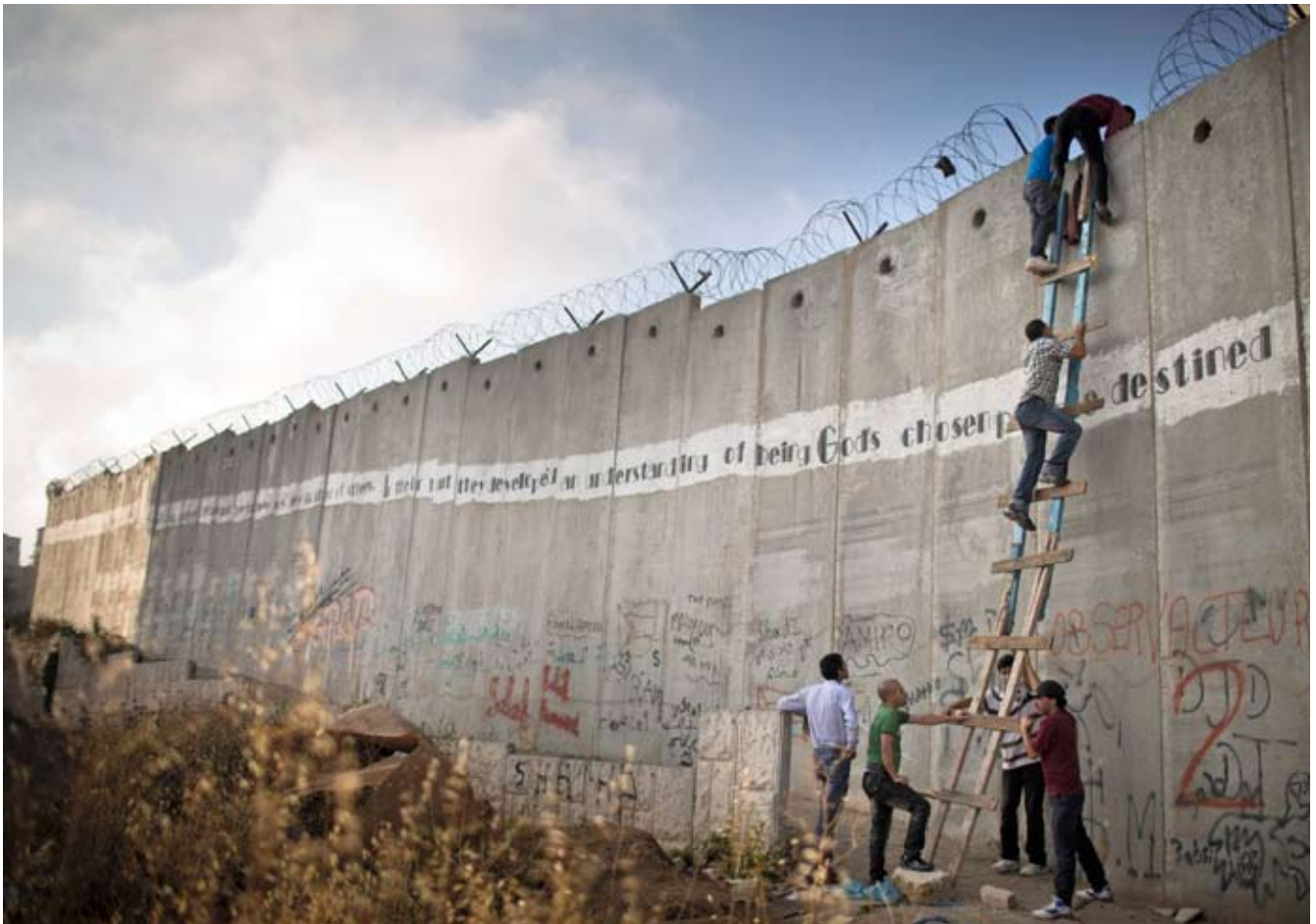
Palestinians scaling the Israeli 'Separation Wall' near A-Ram, north of Jerusalem. Israel built the wall in 2000 to control the movement of Palestinian West Bank residents.