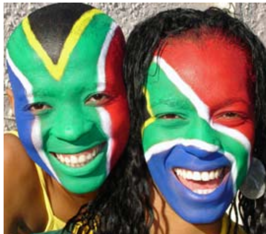
OUR YOUTH: Vital assets for our revolution

On the 6 February 2009, the President signed into law the National Youth Development Agency Act 54 of 2008, ushering in a new era for youth development in the country. Since then, great strides have been made to ensure that young people are adequately supported and empowered to better their lives. The NYDA remains the most viable and relevant institution