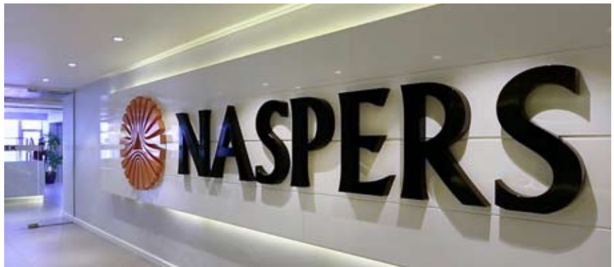
Naspers headquarters: Home of Africa's biggest company

If MultiChoice implements its decision, it has the responsibility to ensure that the workers are absorbed by its other channels or find work elsewhere. The internal inquiry into ANN7 was held to distract attention from the far more nefarious MultiChoice-SABC deal that