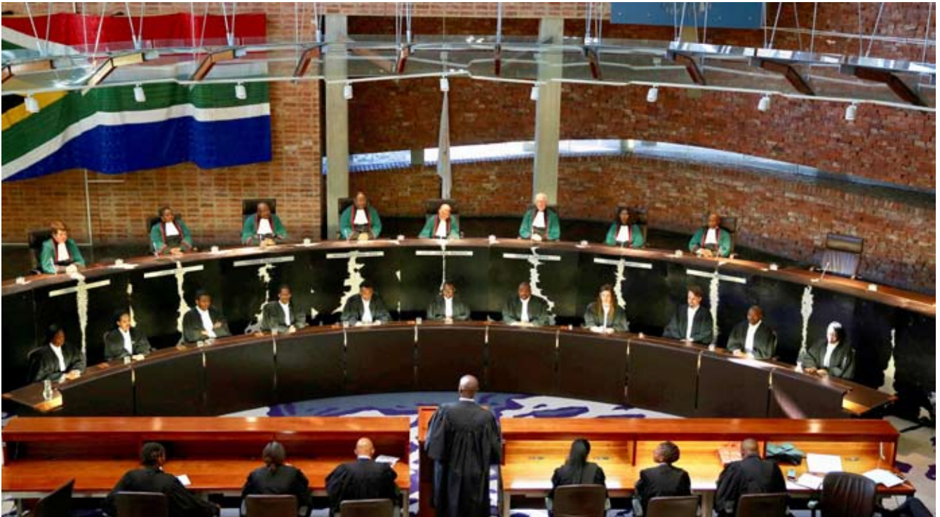
ANC members enforcing rights in court: leaders should react with empathy

Amilcar Cabral when he cautioned: Tell no lies, mask no difficulties, claim no easy victories.