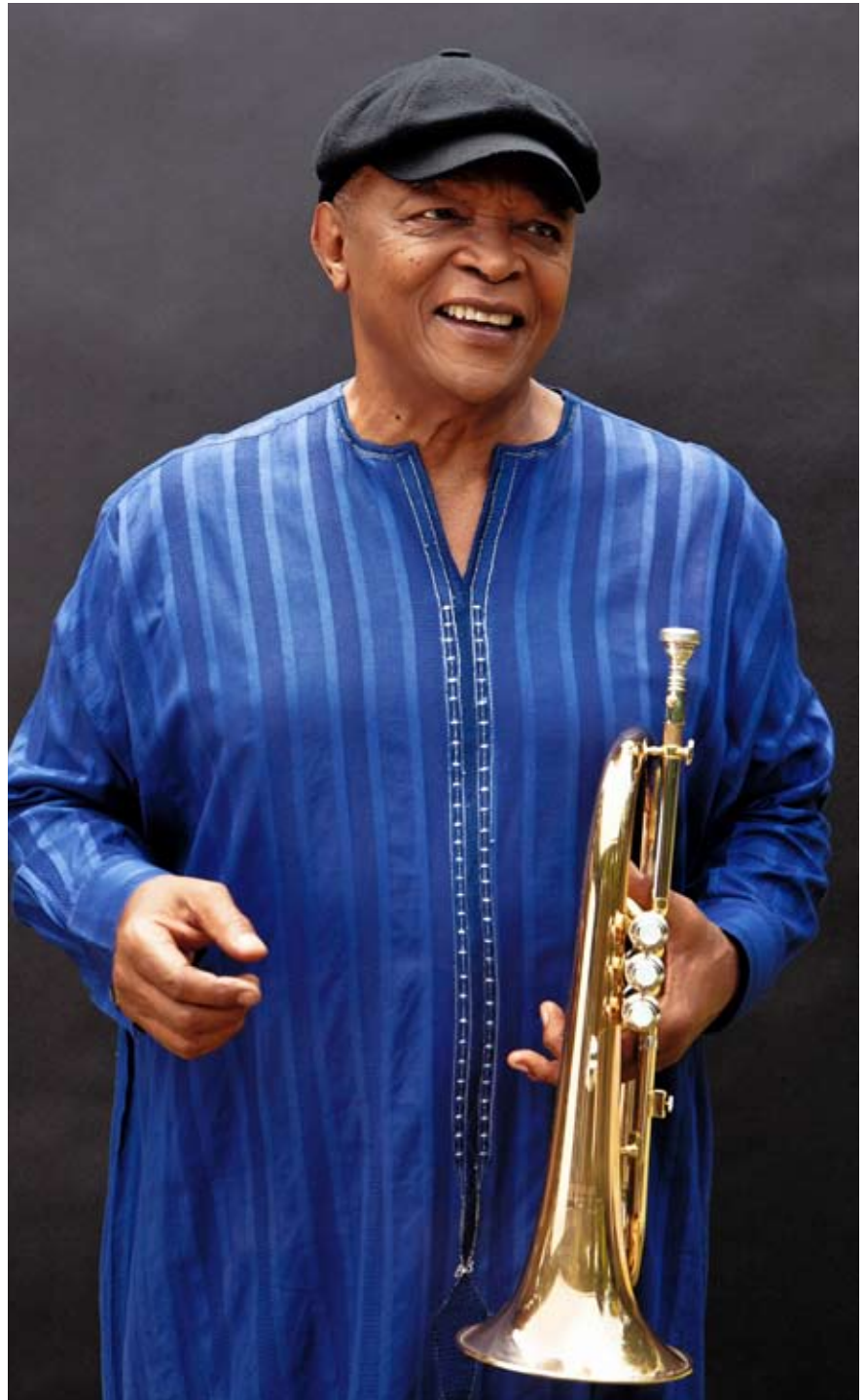
A promotional portrait shortly after Masekela released Bring him home

ing the 1950s and 1960s inspired and influenced him to make music and also spread political change. His music vividly portrayed the struggles and sorrows, as well as the joys and passions of his country.